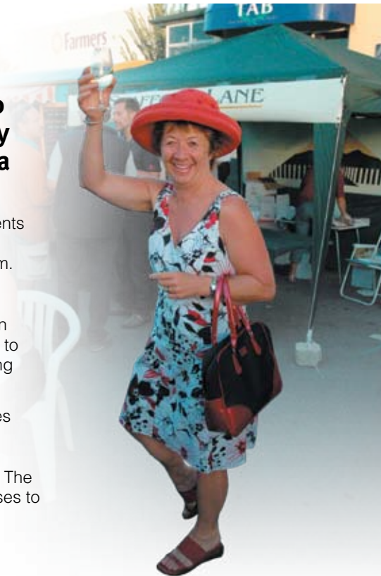
Sample the region's wine and food at Last of the Summer Fare, presented by the Tasman Brewing Company.