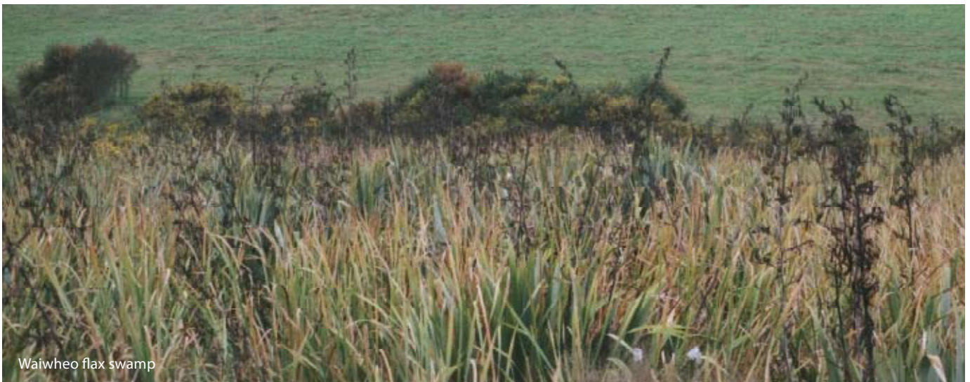
Waiwheo flax swamp

Like a 'fountain of life', wetlands are host to a rich biodiversity