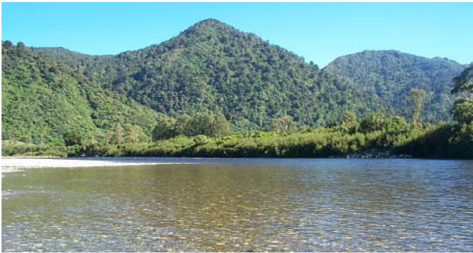
Aorere River at Le Comte. This catchment is the focus of a programme to reduce the concentrations of disease-causing organisms affecting shellfish farms and bathing areas.