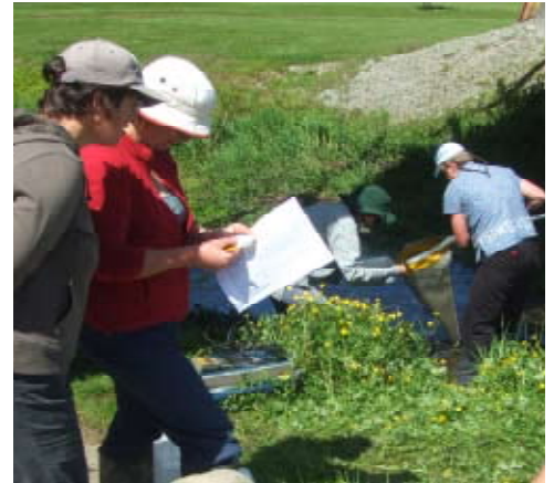
Community Monitoring Demonstration in Motupipi River near Takaka

Many smaller streams in lowland intensive or urban land use areas have poor water quality at all flows. The biggest issues in these small streams are: high water temperatures, particularly in streams draining to Tasman Bay, poor water clarity, excessive fine sediment in the bed, high concentrations of nutrients, E.coli and poor ecological condition, as indicated by the presence or relative absence of pollution-sensitive stream invertebrate life such as insects, crustacea, shellfish, worms etc.