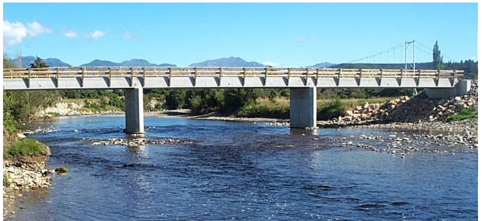
The Kaituna River bridge was constructed in 2004 to avoid pollution by dairy cows crossing the river.

The horticulture industry has dramatically reduced the use of toxic sprays over the last 20 years. Water allocation is often linked to soil type for efficiency.