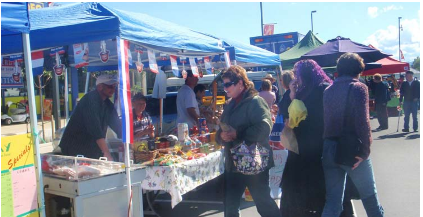
Richmond's Saturday Market has moved to Sundial Square.

Issue #27 – November 2008 Newsletter for Richmond Ward – Tasman District Council