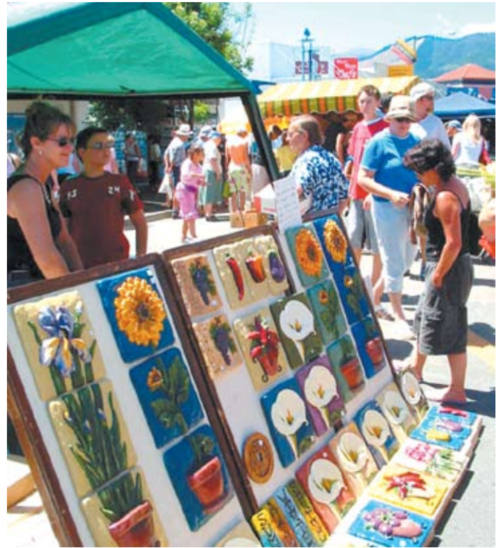
Crowds flock to the annual Richmond Market Day.

For an application form please phone Pam on 544 4898 or email ru@tasman.net .