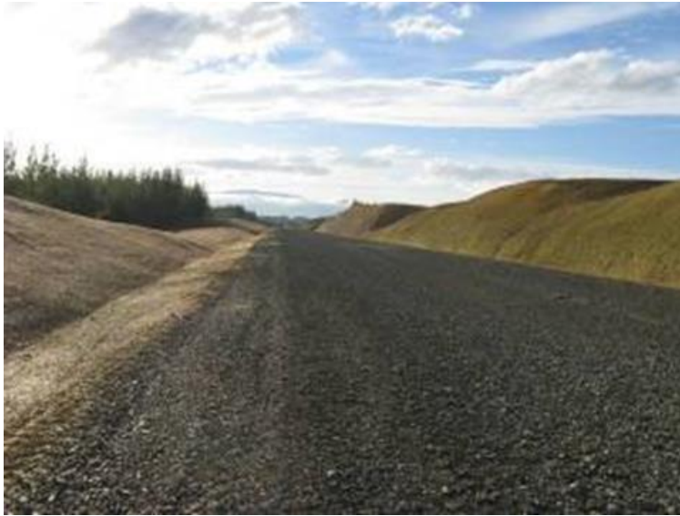
Figure 6-5 Good Example of Straw Mulch, Temporary Seeding and Aggregate Stone to Limit Exposed Area