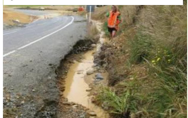
Figure 6-11 Storm damage needing new management and repair