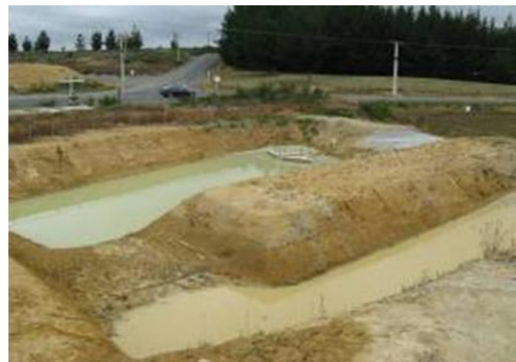
Figure 6-9 Sediment Control Diversion and Sediment Retention Pond