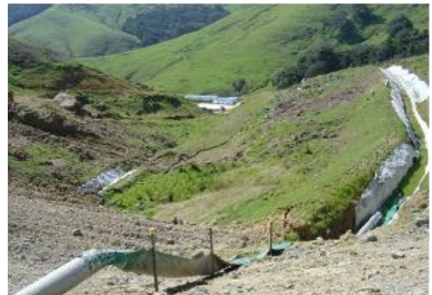
Figure 6-6 Flume Installed to Protect Steep Slope

Highlight steep areas on the ESCP showing limits of disturbance and any works and areas for special protection.