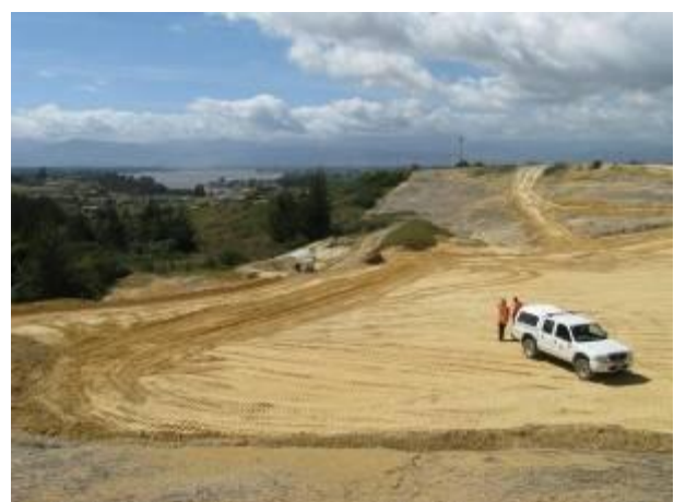
Figure 6-2 Perimeter Bund Leading to Sediment Retention Pond, Estuary in Background

Detail the type and extent of perimeter controls in the ESCP along with the design parameters for those controls.