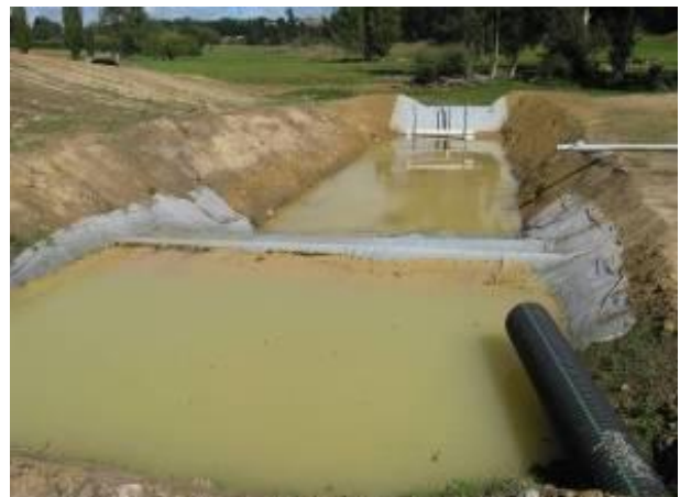
Figure 6-10 Sediment Retention Pond

A large or intense storm may leave erosion and sediment controls in need of repair, reinforcement or cleaning out. Repairing without delay reduces further soil loss and environmental damage.