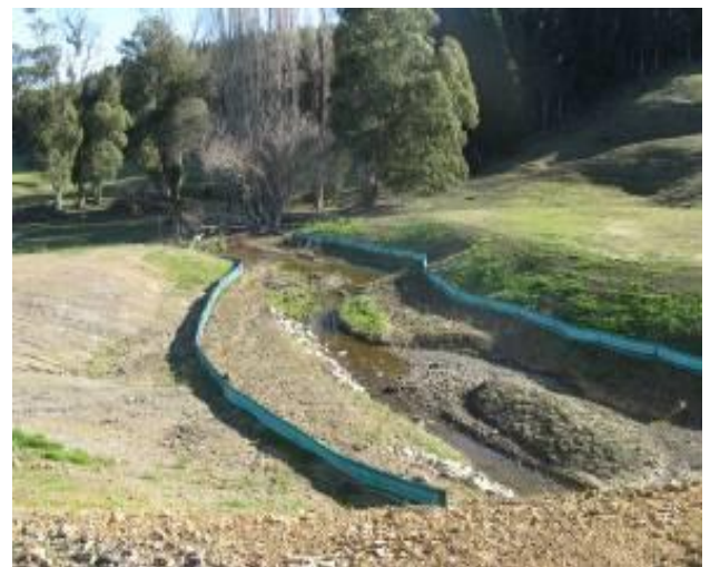
Figure 6-4 Silt Fence Provided for Stream Protection