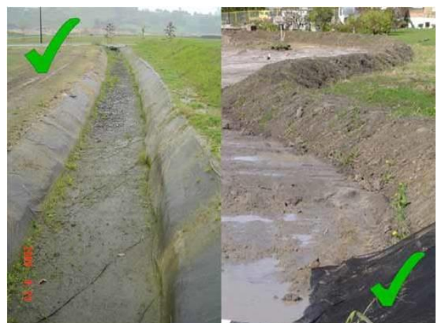
Figure 6-7 Diversion channels separating clean water from disturbed areas

Practices to achieve this include diversion channels and pipe drop structures/flumes which are outlined in Chapter 8 of this guideline.