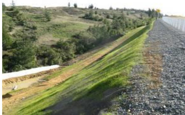
Figure 6-8 Road Construction with Slope Revegetation

In the ESCP clearly define time limits for grass or mulch application, specify grass rates and species and define conditions for temporary cover in the case of severe erosion or poor germination.