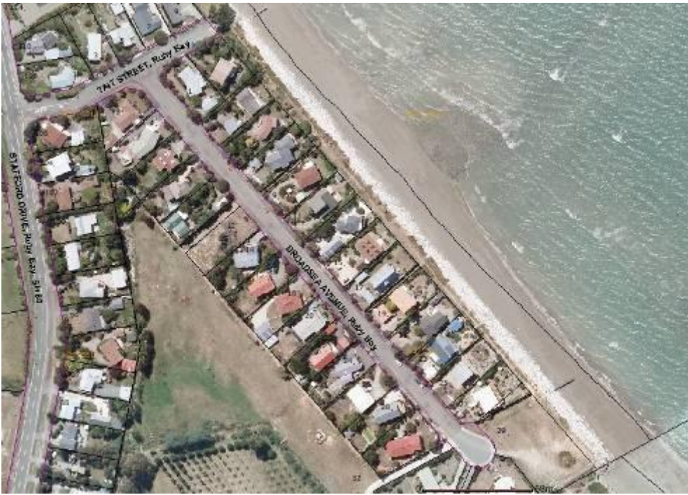
Figure 1: Access to the site off SH60, Tait Street and Broadsea Avenue