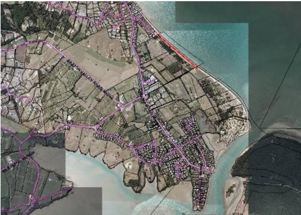
Figure 2: Location of application site north of Mapua township

Southern extent of rock revetment – 2518139E 5995995N