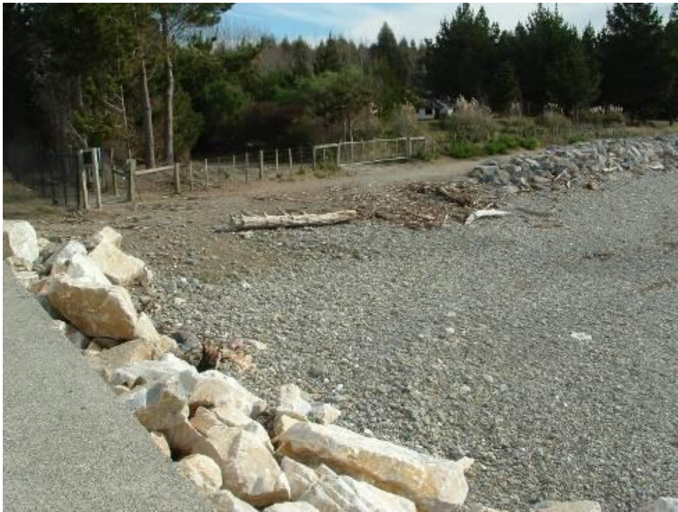
Photograph 4: Existing cobble access off walkway

At the southern end of already completed revetment access is provided by a sloping cobble beach (See Photograph 4).