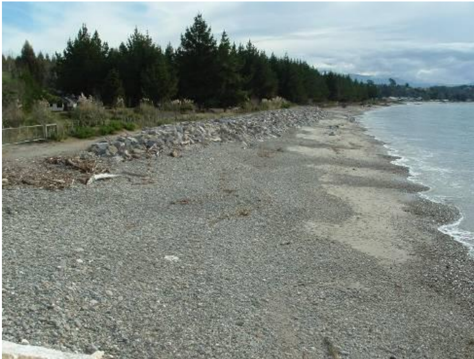
Photograph 2: Stage 1 of the Old Mill Walkway Rock Revetment and cobble beach access

In 2007 the Tasman District Council applied for and was granted coastal permits and land use consents to erect a 175 metres long 5 metres (RL) high rock revetment structure and a 15 – 20 metres wide cobble access beach at the southern end of the Old Mill Walkway Esplanade Reserve as the first stage in a two stage development to protect the walkway from ongoing coastal erosion (See Photograph 2).