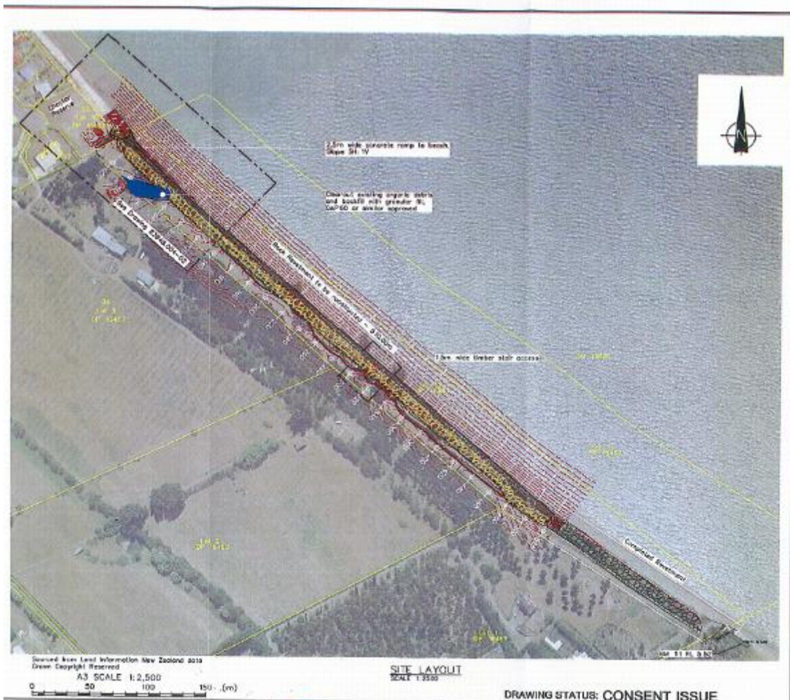
Figure 3: Location of application site