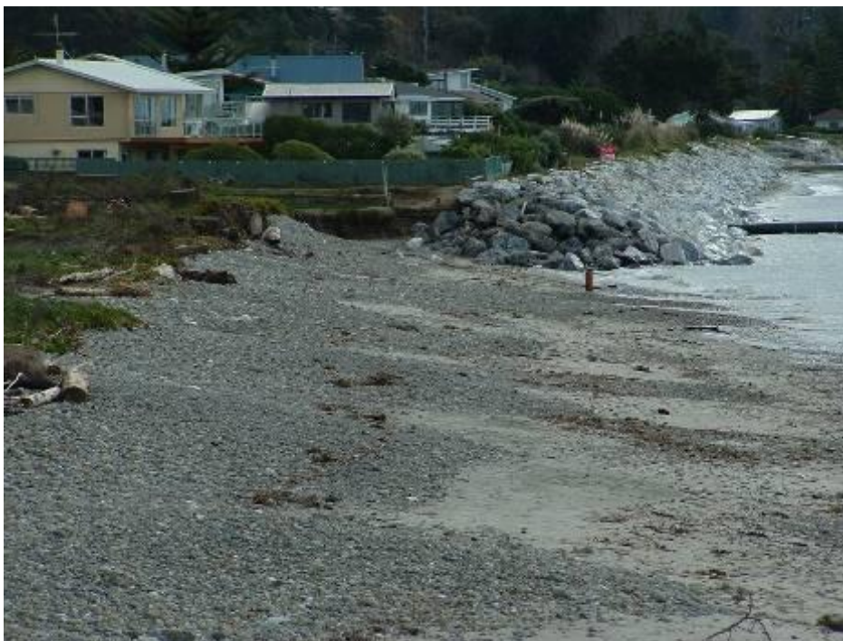
Photograph 3: Existing eroded access off Chaytor Reserve

At present, pedestrian access to the beach is provided off the end of Chaytor Reserve (See Photograph 3), it is proposed that this access be improved by providing a main access point at Chaytor Reserve, and an intermediate access stairway half way along the revetment (See Plan A following recommended conditions). Access from Chaytor Reserve will be provided by a 30 metres long 2.5 metres wide sloping ramp with a grade of 10H:1V. This is considered to be the optimal slope for general pedestrian access and launching of hand held vessels. The ramp will also provide an overland flow path to discharge surface flooding from a regraded Chaytor Reserve.