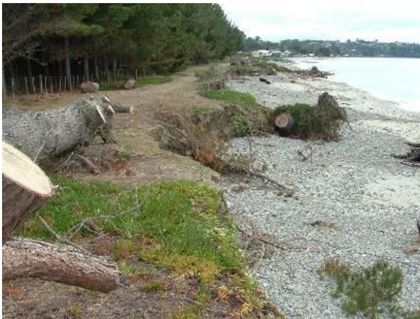
Photograph 1: Erosion at Old Mill Walkway Esplanade Reserve

The reserve has been subject to ongoing coastal erosion over the past two decades and suffered particularly badly as a result of a storm in June 2006 (See Photograph 1). Since its vesting, the reserve has been reduced in width from 60 metres to 3 – 4 metres in some of the worst affected places.