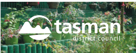
Detailed contrasting image

Use of the coloured logo on a similarly coloured/ non-complimentary coloured background.